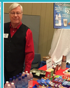
Sell snacks or volunteer as an usher, and see the show for free!