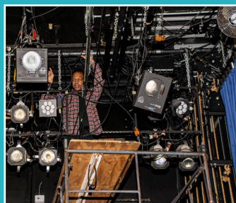
Learn how to run spotlights or the sound board—or join the fun backstage on deck crew.