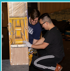
Set builders are always welcomed. Not handy with tools? We'll train you!

Whether you’re already skilled or just keen to learn, we have opportunities for you to join the fun of live musical theatre. If you’re curious, please email us at chairperson@southbaymt.com , call us at 408-266-4734, or go online at southbaymt.com/join-us/volunteer to let us know about your passions.