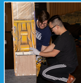
Set builders are always welcomed. Not handy with tools? We'll train you!

Whether you’re already skilled or just keen to learn, we have opportunities for you to join the fun of live musical theatre. If you’re curious, please email us at chairperson@southbaymt.com , call us at 408-266-4734, or go online at southbaymt.com/join-us/volunteer to let us know about your passions.