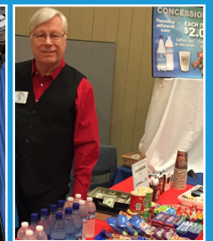
Sell snacks or volunteer as an usher, and see the show for free!