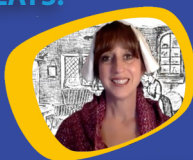
Book of Will