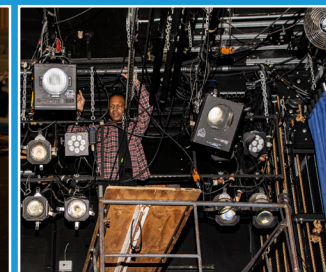
Learn how to run spotlights or the sound board—or join the fun backstage on deck crew.