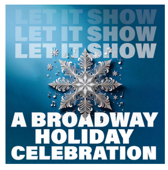
December 20-21, 2025