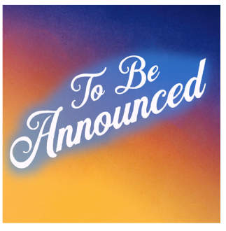
May 16 to June 6, 2026